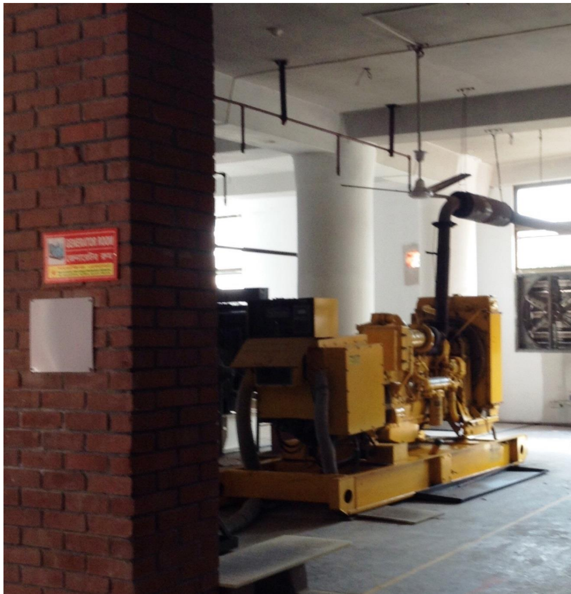
Missing Vibration Absorbers on Generator Room