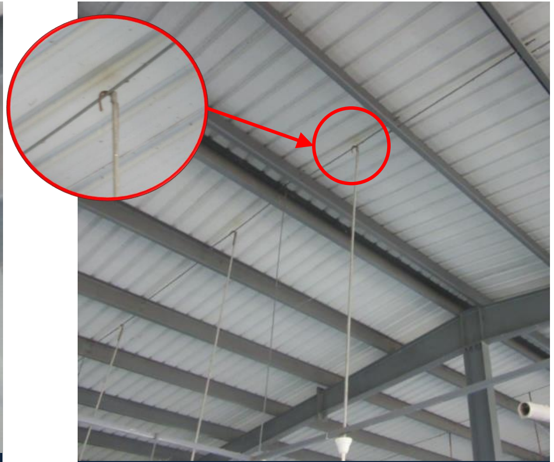
Hangers hooked on purlin lateral restraints