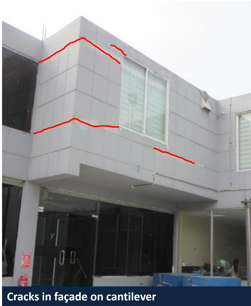
Cracks in façade on cantilever