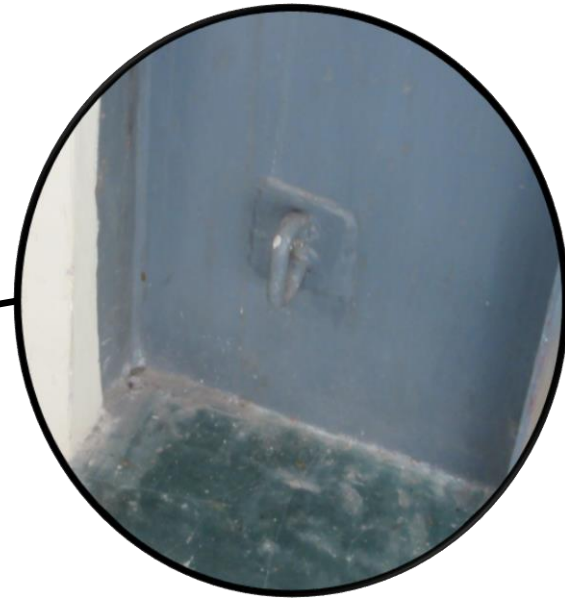
Connections for bracing unused