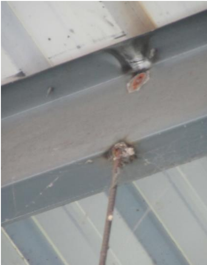
Holes drilled into purlins and hangers welded on