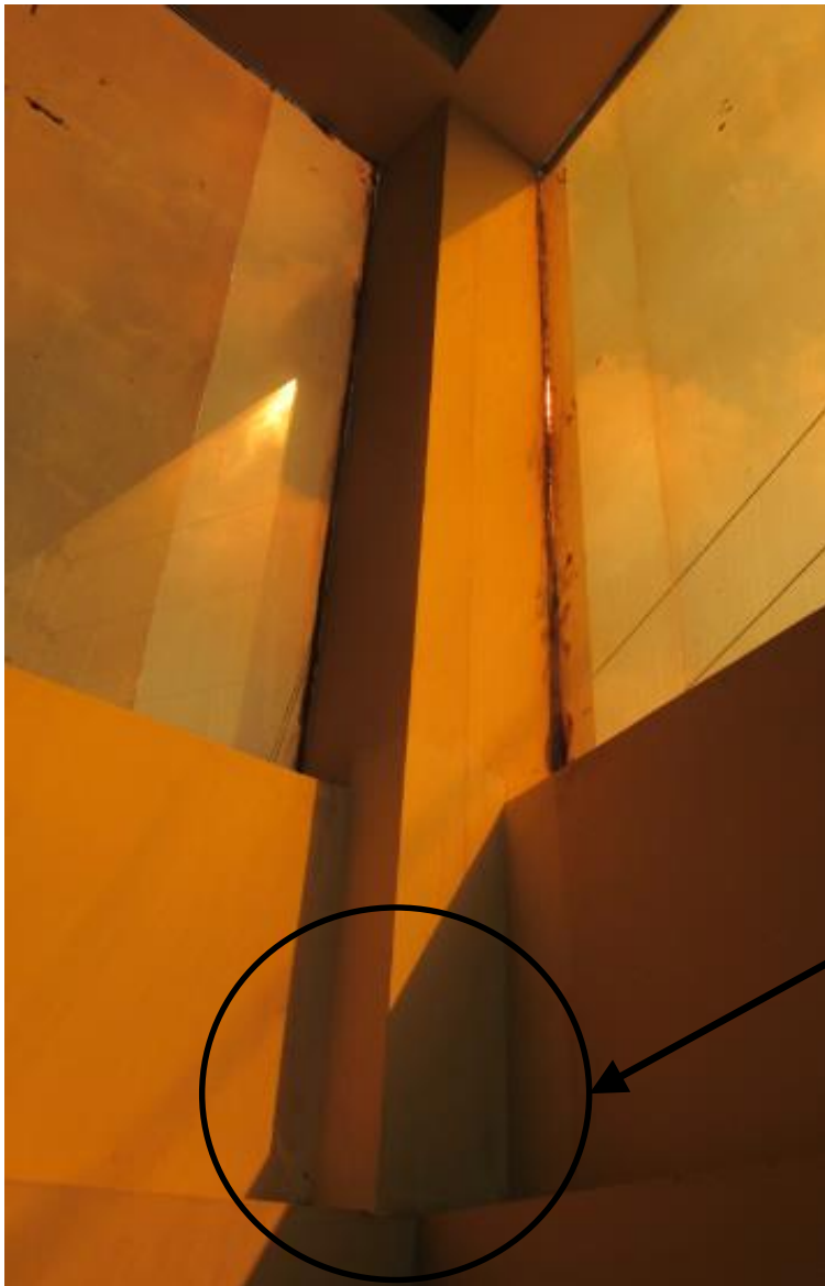
Crack recently painted over